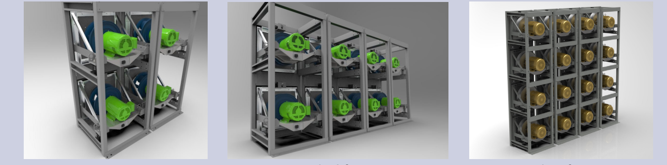
2 by 2 fans

In addition to vertical fan towers, the new ClimateCraft compact FanMatrix towers are also available in multiple arrangements to optimize fan space in projects with the most challenging footprint requirements.