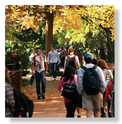
Students Walking Under Autumn Colors

In the spring of 2011, Vanderbilt University Medical Center sought to update HVAC equipment for a 17,000 sq. ft. research facility within its 800,000 sq. ft. Medical Center North building on its Nashville, Tenn. campus. The existing air handling unit had begun to fail and was no longer providing adequate air flow throughout the facility.