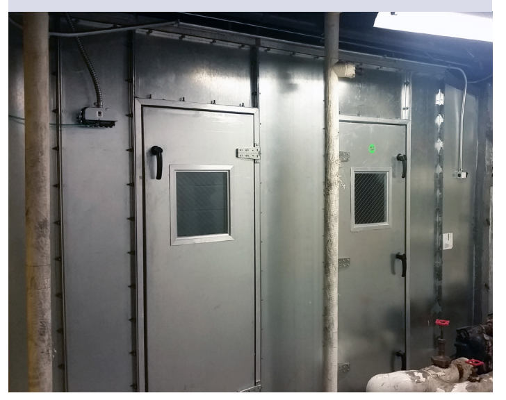
The final result—the ACCESS air handler replacement section installed and operational.

Director of Engineering and Technical Support at the University