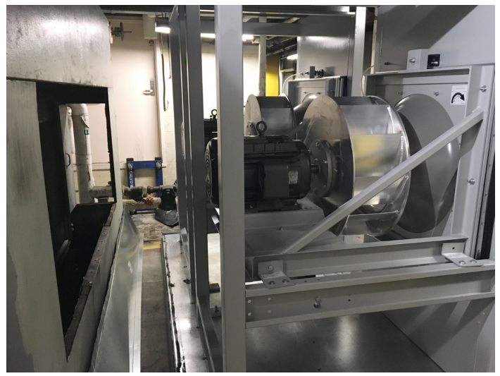
The FanMatrix<sup>™</sup> fan array section ready for installation in the ACCESS site-assembled replacement air handler.

can't believe that they were able to have a new unit built, delivered and installed in five days," he said.