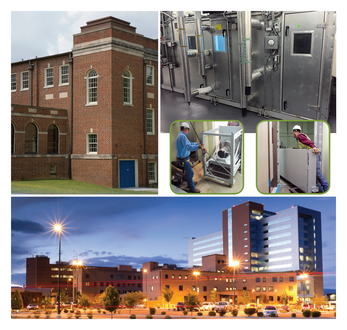
We make air handling technology. Better.