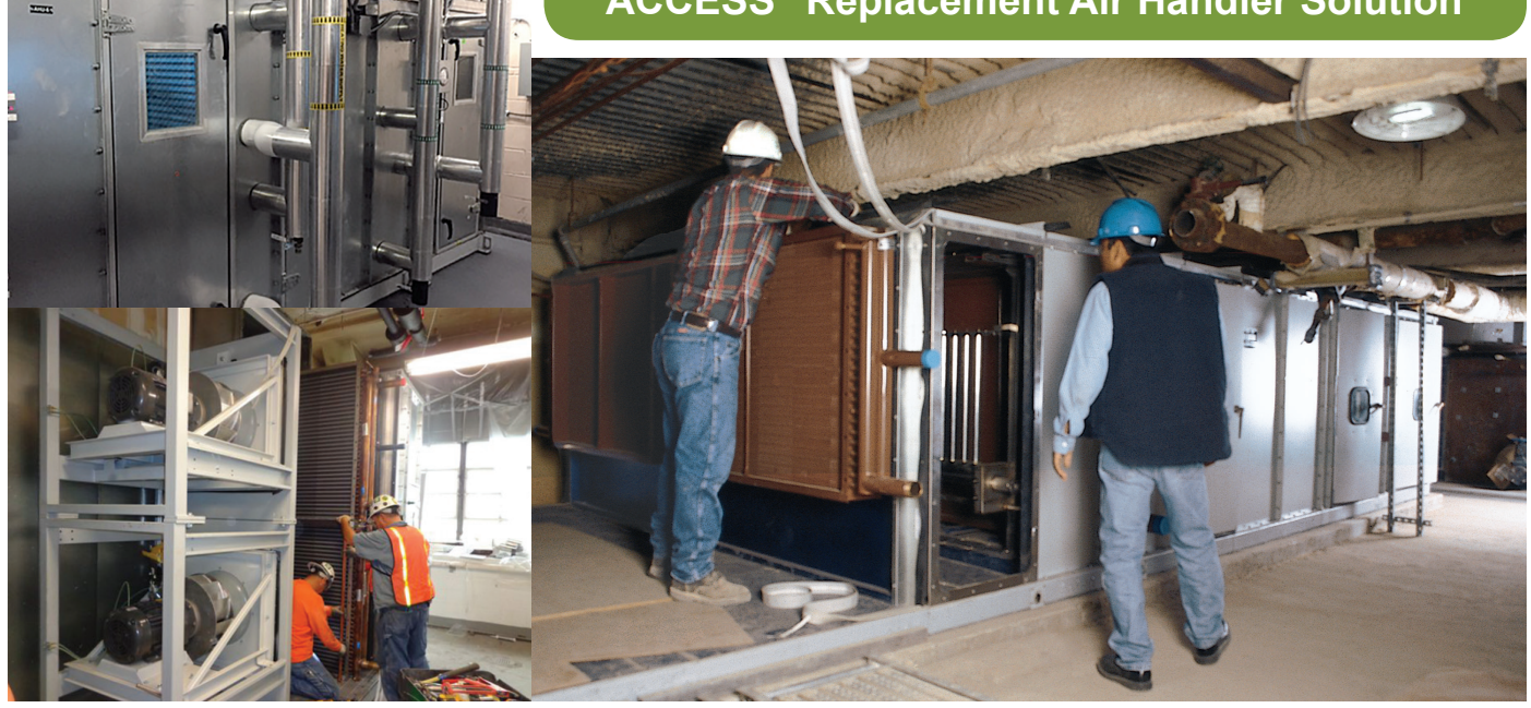
When you have an air handler replacement project with tough challenges that could result in significant costs or missed schedules, choose the ACCESS replacement solution from ClimateCraft.